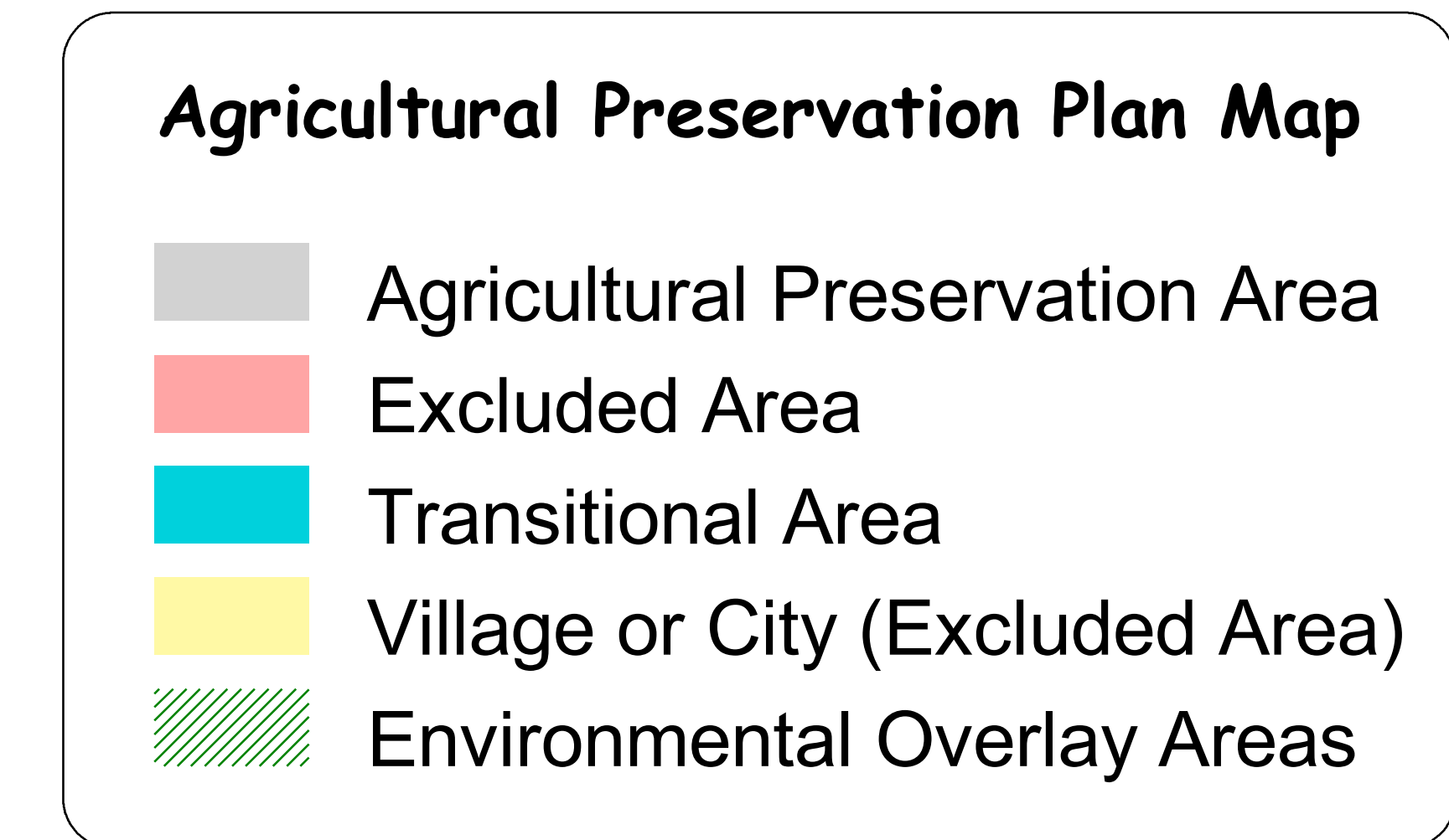
Kewaunee County Ag Pres Plan Map (South 1/2 of County) - Final Version for Certification